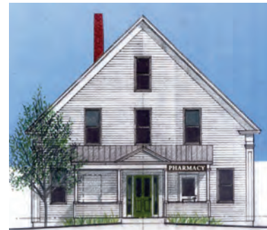
The front of the new Messenger Valley Pharmacy will retain its traditional New England farmhouse look.

T HANKS TO A VERY GENEROUS COMMUNITY, Grace Cottage's newly expanded and renovated Messenger Valley Pharmacy project is moving forward. Over $330,000 has been raised towards the $350,000 project fundraising goal. 30 ServCorps volunteers from Hartford, Connecticut, will be in Townshend for two weeks in early October to help build the new addition. The construction project is planned to assure that there will be no interruption in the filling of prescriptions, and popular over-the-counter items will also be available. The ribbon-cutting ceremony for the new store will be held in early December.