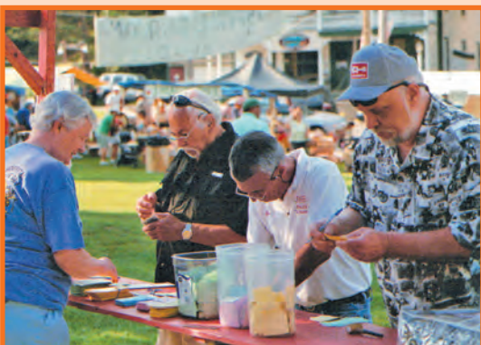
Raffle tickets are a big hit at Fair Day.