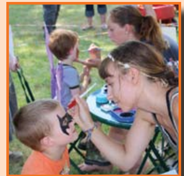
Transformation into Batman!