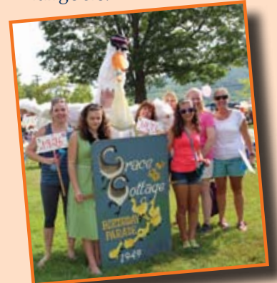
Several "babies" born at Grace Cottage surround the stork.